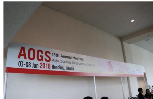
Fig. 1. Registration booth at the HCC.